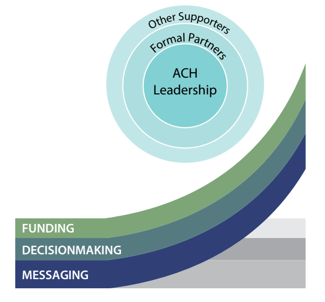
Figure 3. Center of Gravity: an ACH can influence a range of decisions to align with its goals